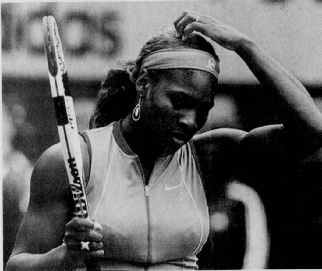
Serena Williams reacts during her quarterfinal match in the French Open tennis tournament.

Williams again hit a shot into the net, and Capriati resumed her celebration.