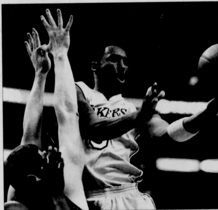
Los Angeles Lakers' Kobe Bryant goes up for a shot against Minnesota Timberwolves' Mark Madsen during the fourth quarter of the concluding Game 6 of the NBA Western Conference Finals.

Karl Malone and Gary Payton, who signed with the Lakers last