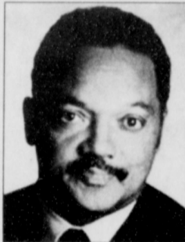
Rev. Jesse L. Jackson

The Bush Administration's plan to transfer symbolic power on June 30th has more to do with this fall's election than it does with the state of readiness to govern in Iraq. Just as the timetable to hype the need for a war with Iraq was based more on the fall 2002 election schedule than it was on the supposed imminent danger we were facing from weapons of mass destruction, now we are supposed to