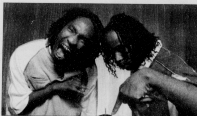
The Ying Yang Twins' feel-good party songs have put them at the top of the charts in pop music.

The Ying Yang Twins are scheduled to perform on the fifth night of