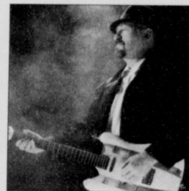
Dave Mason, a rock music legend, performs during the Rose Festival Concert Series, on Friday, June 11.

Admission to the concert series is included with the Rose Festival $5 gate admission to the Pepsi Waterfront Village.