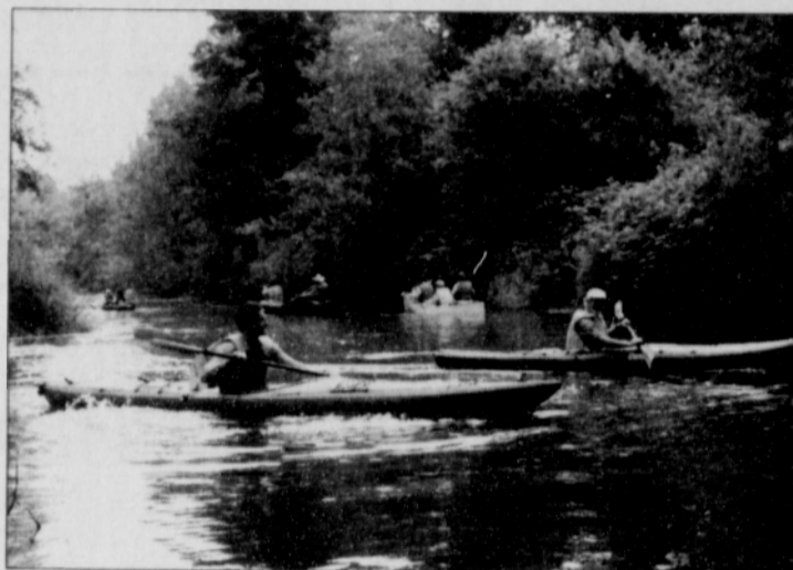
Canoeers and kayakers enjoy a day on the Columbia Slough, a waterway rich in wildlife that parallels north and northeast Portland.

Highlights include free canoe trips, music, bird watching, environmental games and displays, bilingual storytelling, Folkloric dancing, refreshments and more. Guests will also receive the Spanish recreation