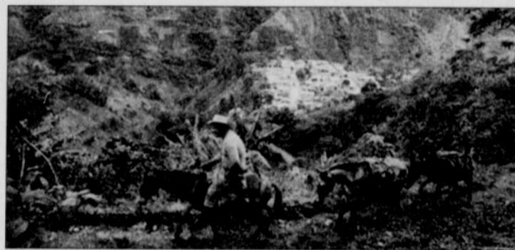
A man leads his mules through a path overlooking Gaitania in the coffee growing mountains of the Tolima state, 255 miles southwest of Bogota, that was the cradle of the Revolutionary Armed Forces of Colombia.

A string of rebel bomb attacks coinciding with the anniversary have killed at least 13 people and wounded more than