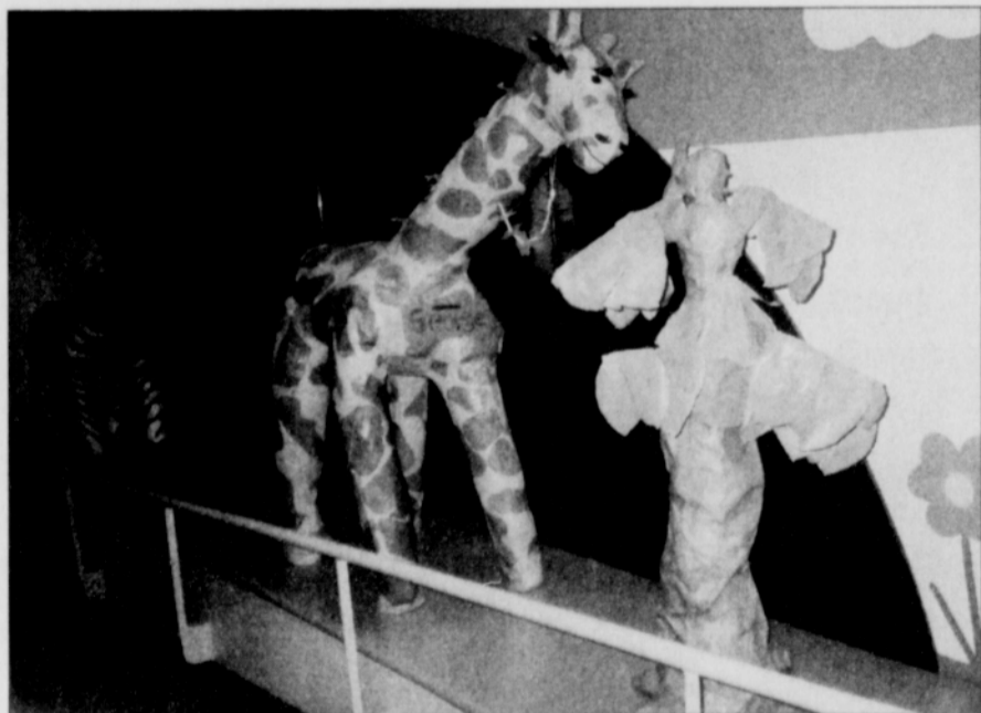
A set of large animals at Legacy Emanuel Hospital's children's ward adds eight new critters with the help of artists from local elementary schools and The Core Source: Center for Leadership and Innovation in northeast Portland.