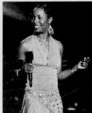
La Toya London performs May 5 on Fox TV's 'American Idol.'

"I think it's a travesty," echoed Randy Jackson.