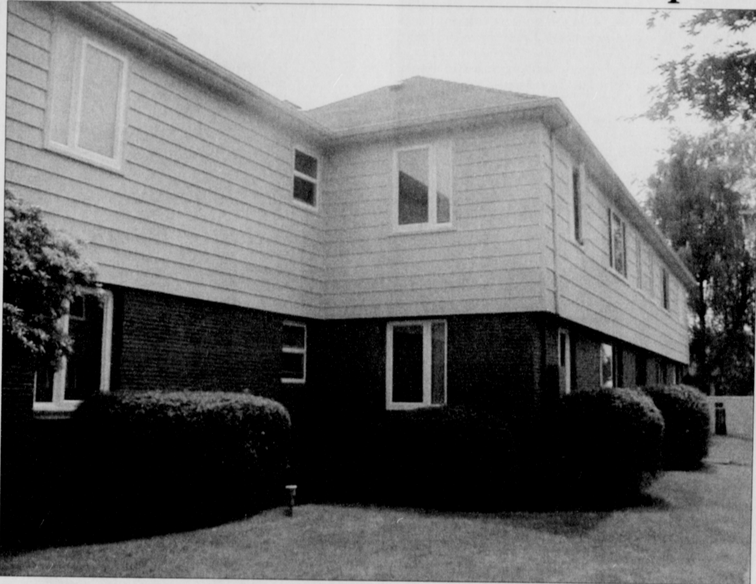
Bright exterior walls of gold and terracotta give new life to the Park Terrace Apartments at 315 N. Alberta. The affordable housing complex is also shining with new windows, exterior lights, landscaping and laundry facilities.

Retains local population in homes that are affordable