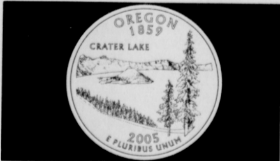
The Oregon Commemorative Coin Commission recommended to Gov. Ted Kulongoski that a view of Crater Lake appear on the reverse side of Oregon's commemo-

rative quarter when the United States Mint releases it around June of 2005. The Governor will send a recommendation to the director of the United States Mint this month.