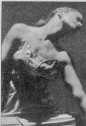
Polaris Dance Theater brings innovative choreography and athletic, powerful movements to Art Beat.

The event will have one of the regions most prominent and respected artists as the featured artist in 2004 in Native-American painter James Lavadour. The east-