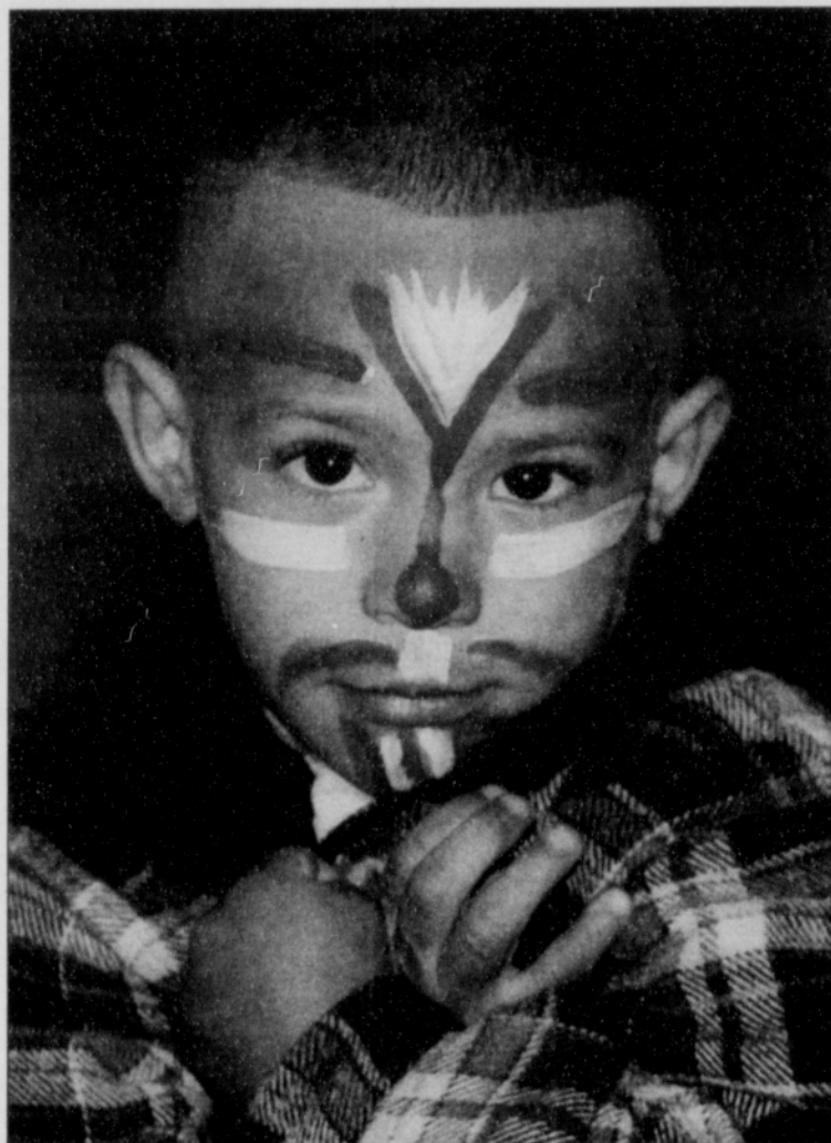
Face painting is part of the festivities at the Alberta Art Hop.