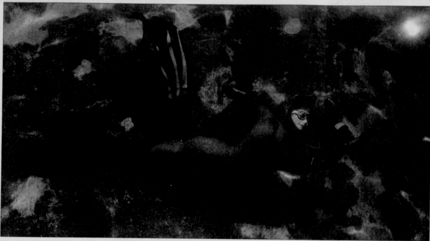
Water Bodies skillfully blends live dance and video into a stunning stage performance.