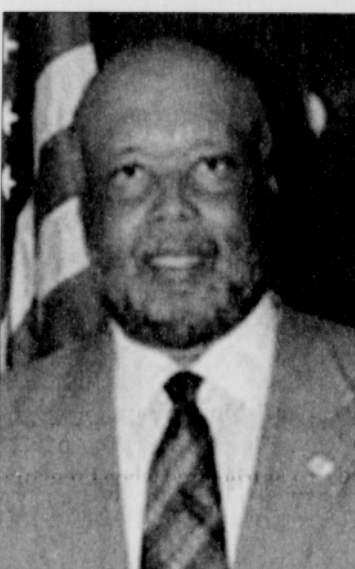
Rep. Bennie G. Thompson

President Bush, Dr. Rice and others in the Administration knew that bin Laden posed a threat to our homeland, but did not act in the best interest of national security. Clearly, the