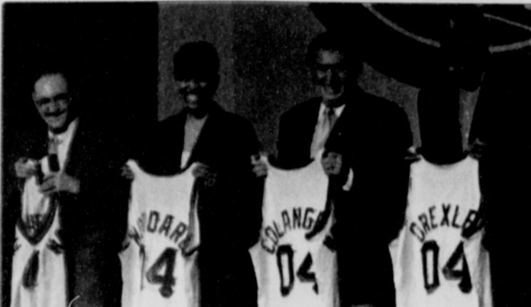
Basketball Hall of Fame inductees Bill Sharman (from left) Lynette Woodard, Jerry Colangelo and Clyde Drexler at the Hall of Fame induction ceremony Monday in San Antonio. The group will be enshrined on Sept. 10 in Springfield, Mass.

In college, he played in two Final Fours. In his 15-year NBA career, Drexler led the Portland