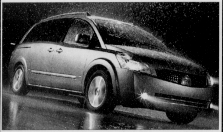
Tested vehicle information: price: $25,980, engine: 3.5 liter, V-6 and the transmission 4-speed automatic.

The all-new cutting edge design and plenty of extras draws the attention of the vehicle shoppers. Nissan Quest could hold up to the familiar long-standing competition of Honda Odyssey or Toyota Sienna with its "performance oriented" product line. The vehicle provides features like: fold-flat middle-row captain's chairs, poweradjustable foot pedals and Nissan's unique Skyview Roof. The instrument panel is a single cage cluster and information screen in the