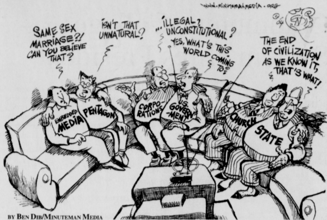
BY BEN DIB/MINUTEMAN MEDIA

Opinion articles do not necessarily reflect or represent the views of The Portland Observer