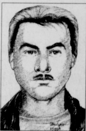
A composite sketch of the man who kidnapped a girl from King School.