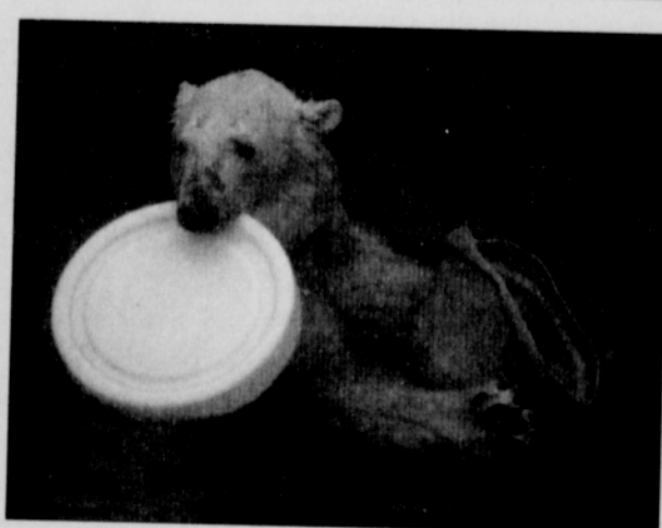
Pygmy goats and polar bears will be featured in tropical paradise-themed events during Spring Break, March 21-28 at the Oregon Zoo.