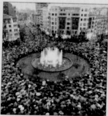
Hundreds of thousands of people fill Cibeles Square in Madrid on Friday during a demonstration to protest train bombings in the Spanish capital.