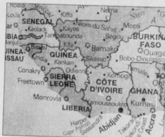
Cote d' Ivoire (Ivory Coast)

Today, the Republic of Cote d' Ivoire has around 20 million inhabitants and is still edging forward in a positive direction. Human rights organizations around the world have also helped improve working and living conditions for the excessively poor. Still, life expectancy for men and women is only in the mid to late 40s. French continues to be the official language. The religious composition of the country shows approximately 20 percent Christian, 20 percent Muslim and 60 percent indigenous beliefs. The country's inhabitants still wish for total independence and a bright future.