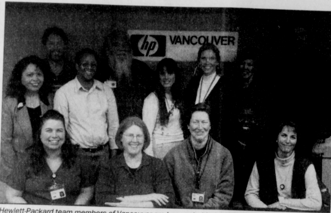
Hewlett-Packard team members of Vancouver are honored with the Val Joshua Racial Justice Award.

A book titled "My Soul Looks Back in Wonder: Voices of the Civil Rights Experience" will be published in May to correspond with the 50th anniversary of the Supreme Court's Brown v. Board of Education ruling, which declared "separate but equal" schools to be unconstitutional. Additional stories, features, interviews, and essays will appear in a special edition of AARP "The Magazine," followed by coverage throughout the year in all AARP publications and radio programs as well as on the Leadership Conference Web site at www.civilrights.org .