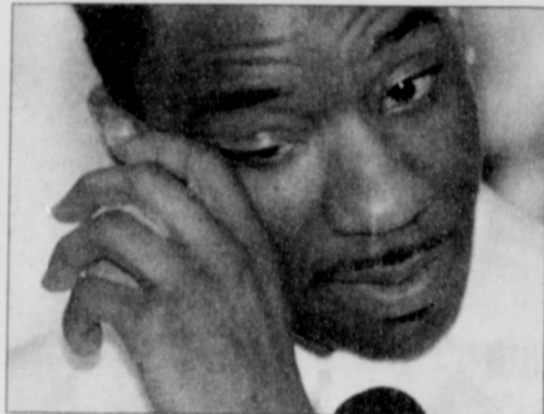
Terrell Brandon wipes a tear from his eye during an emotional news conference where he announced his retirement from the NBA.