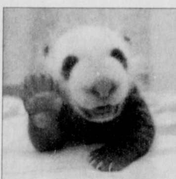
A baby giant panda gives photographer Gerry Ellis a greeting.

Photographer reveals plight of endangered species