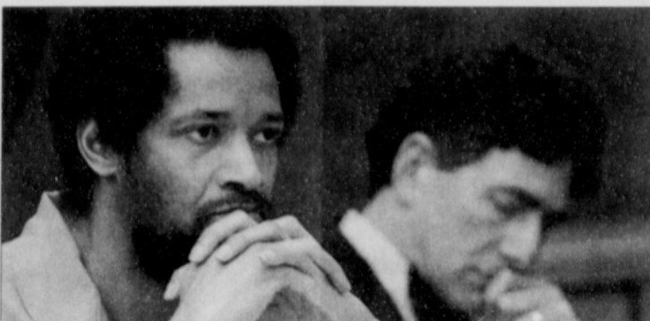
Convicted sniper John Allen Muhammad (left) during sentencing Tuesday in Manassas, Va.