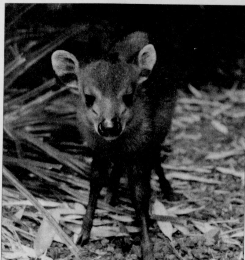
A female red-flanked duiker was born Jan. 30 at the Oregon Zoo.