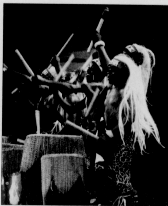
Children of Uganda, a dance troupe of children orphaned by AIDS inspires joy and hope. The company performs in Portland March 31 at the Arlene Schnitzer Concert Hall.

A Portland Jam Night plans to heal the community's ills through laughter at the Wave Theatre in North Portland. The live music and sketch improv. Comedy is at 9 p.m. Fridays. Tickets are $7 for adults and $4 for kids. For more information, call 503-735-4184 or visit www.jam-night.com .