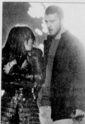
Justin Timberlake and Janet Jackson's controversial performance at last month's Super Bowl.

Timberlake was engulfed in controversy after he ripped off part of Janet Jackson's