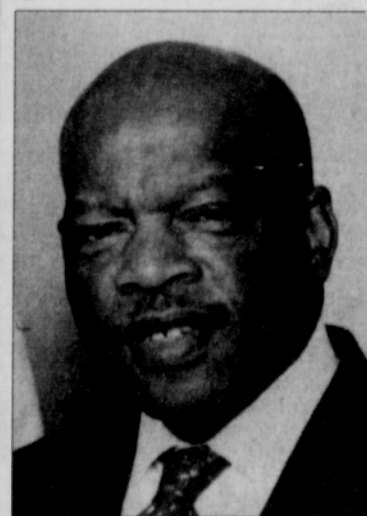
U.S. Rep. John Lewis