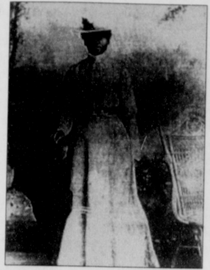
Mary Elizabeth Bowser leaked Confederate documents to the Union Army during her service as a maid in a Confederate home.

By the end of World War II, it was clear that American-American nurses were just as skilled as white nurses. In the wars to follow they would work side-by-side with white nurses on all sides of the battlefield.