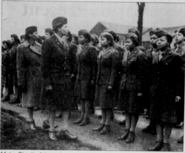
Major Charity Adams inspects her troops of Army nurses in 1945.