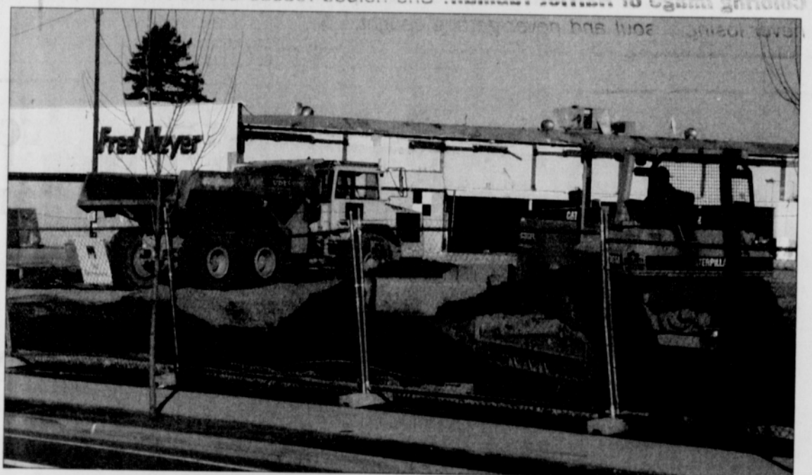
Crews have turned the Fred Meyer store at North Interstate Avenue and Lombard Street into a construction site to make way for a brand new shopping center.