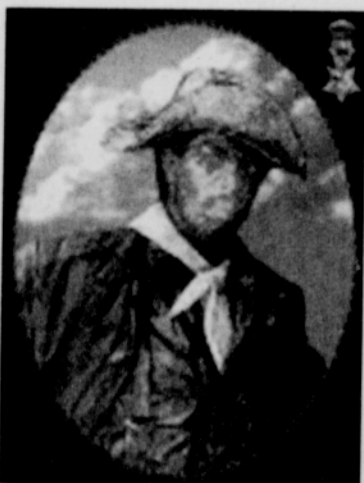
Sergeant Emanuel Stance was the first African-American soldier to receive the Medal of Honor in 1870.

Racism reared its ugly head when Flipper was falsely charged with "embezzling public funds," and forced out of the military. Often successful black businessmen or military personnel were subjected to such treatment. Flipper became a successful engineer, used his skills in Spanish to help interpret important land documents, and helped build a railroad to in Alaska.