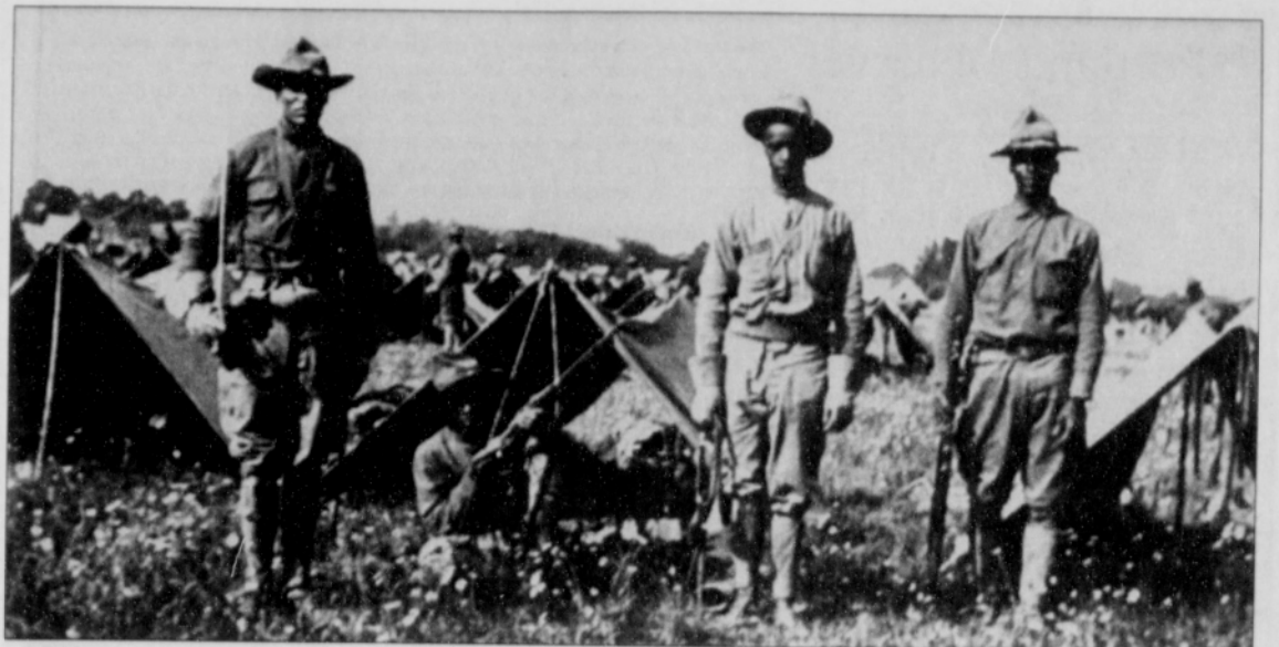
Members of the U.S. 10th Calvary, composed entirely of African Americans, camped out in Sidney, N.Y. in 1911.

When the black soldiers returned home, many were met by celebrations in their honor. However some were assaulted or killed by jealous whites who would not admit the black soldier was every bit as good as a white soldier in combat.