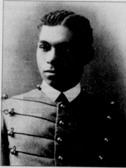
Henry Ossian Flipper was the first black graduate of West Point.

John L. Pershing, the commander of the 10 th Calvary, put the importance of the African-American regiment in perspective when he was quoted as saying "We officers of