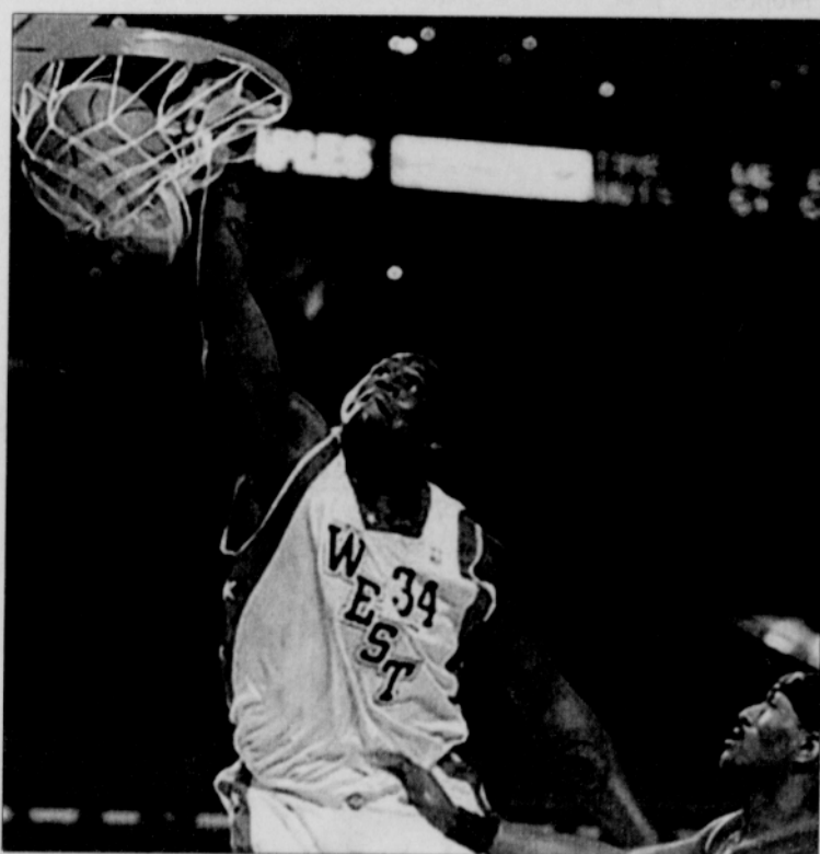
Shaquille O'Neal dunks as Ron Artest looks on during the second quarter of the NBA All-Star Game on Sunday at the Staples Center in Los Angeles. O'Neal scored 24 points - 18 of them came on dunks - and was named MVP.

"I had a lot of fun," he said. "A couple of people told me if I get it, there's an opening, they want me to go coast-to-coast. A couple of times, I had a couple openings. A couple of times, I didn't finish them, but the one in the fourth quarter, I crossed (Tracy McGrady) up at half