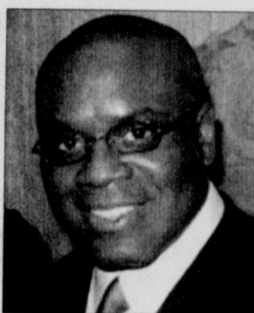
Antonio 'L.A.' Reid

Reid, who over his career as a music producer and label head has racked up hits with artists such as Whitney Houston, Avril