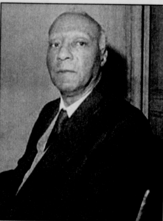
A. Philip Randolph

Roseland Theater welcomes Buddy Guy, Jerry Cantrell, Living Colour, Double Trouble, Indigenous, Paul Rodgers, Mich Mitchell and Billy Cox from the Jimi Hendrix Experience at 8 p.m. on Tuesday, Feb. 24. Tickets are available by calling 503-224-8499.