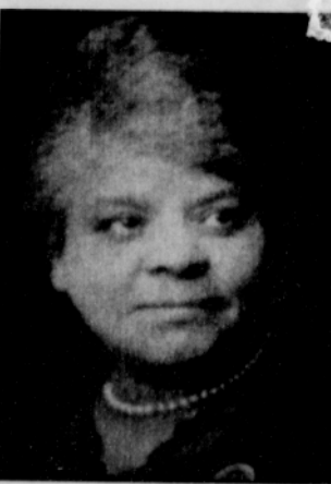
Ida B. Wells

Black women's activism is celebrated by the group Radical Women with a showing of the film "Passion for Justice" on the life of Ida B. Wells at 7 p.m. Wednesday, Feb. 25 at the Bread and Roses Center, 819 N. Killingsworth. Donation is $3. For more information, call 503-240-4462.