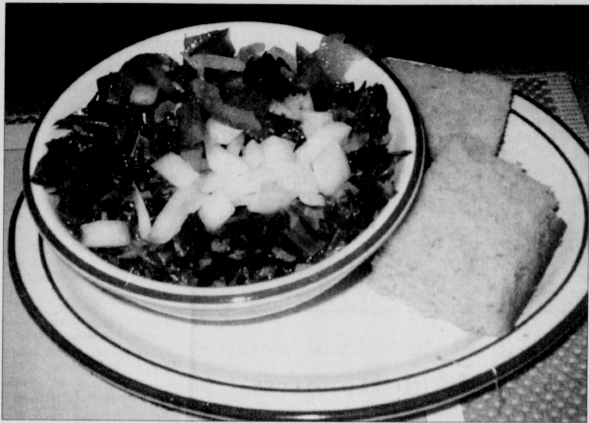
A vegetarian side of collard greens and cornbread are some of many of the contributions of African-American cuisine that contain compounds that can be good for your health, targeting diseases such as cancer, heart disease and blindness.

Black-eyed peas - like other varieties of beans, black-eyed peas are a good but under appreciated source of antioxidants, chemicals that are believed to reduce the risk of cancer, heart disease and aging. In general, beans may provide health benefits similar to some common fruits, including grapes, apples and cranberries. Studies have found that black and red beans, which are common in many ethnic dishes including soul food, were particularly high in antioxidants. In general, beans are also good sources of protein, carbohydrates, folate, calcium and fi-