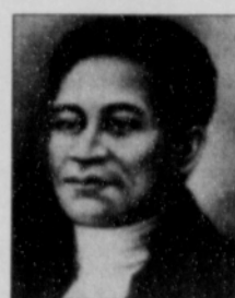
Crispus Attucks (above and center left) was a runaway slave from Framingham, Mass. He led the charges against British troops in the "Boston Massacre."

these women full control of their homes and lands until they returned. Black men were also used for scouts, wagoners, cooks, and