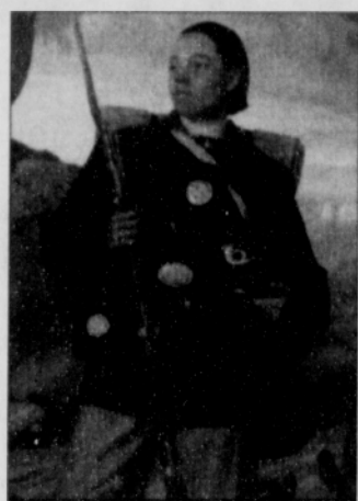
Cathay Williams disguised herself as a man to fight in the U.S. Army as a Buffalo Soldier.

Prior to the colonial times, an African by the name of Estevanico landed in present day Florida with a group of Spanish explorers who had left Spain with 600 men. By the time they reached the eastern shores of Texas, only Estevanico and three Spaniards were still alive due to battles with Native Americans.