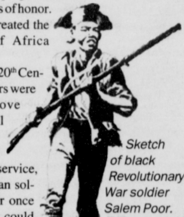
Sketch of black Revolutionary War soldier Salem Poor.