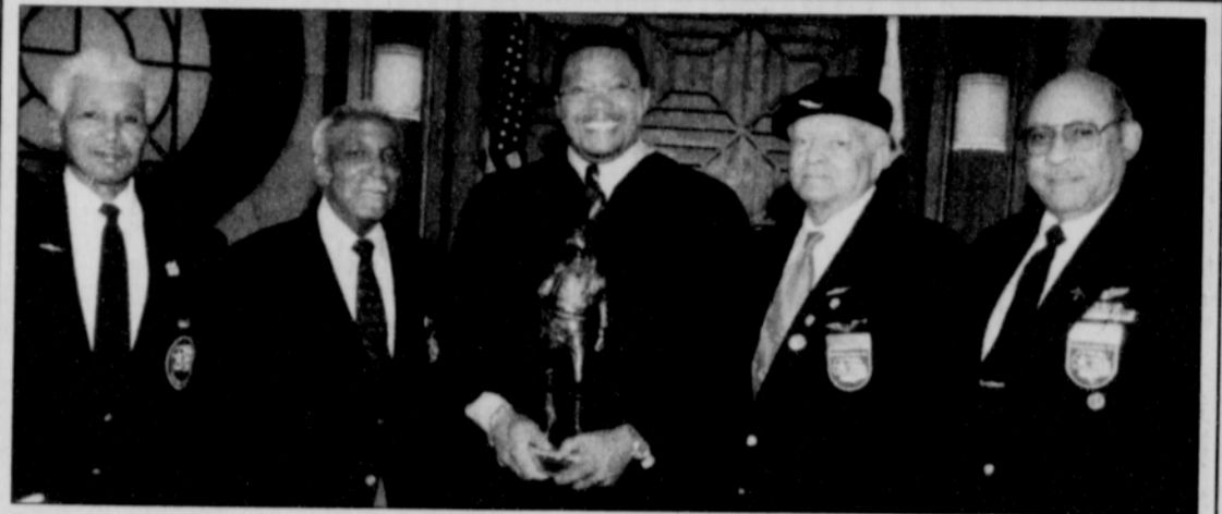
TV court Judge Greg Mathis and former members of the Tuskegee Airmen join forces to salute Black History Month on the nationally syndicated show "Judge Mathis."