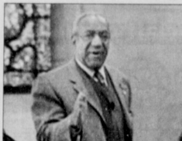
Bill Cosby visits the Riverside Church in Chicago to encourage kids to get an education and build self-esteem during a Black History Month event.

(AP) — Bill Cosby got serious with 500 ninth-graders at a talk last week commemorating the Supreme Court's landmark Brown v. Board of Education ruling.