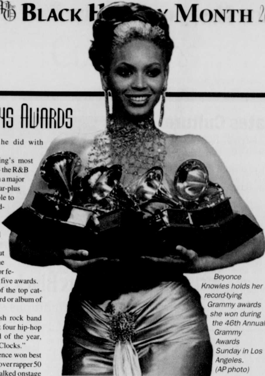
Beyonce Knowles holds her record-tying Grammy awards she won during the 46th Annual Grammy Awards Sunday in Los Angeles.

Beyonce also won best female R&B performance and best contemporary R&B album for "Dan-