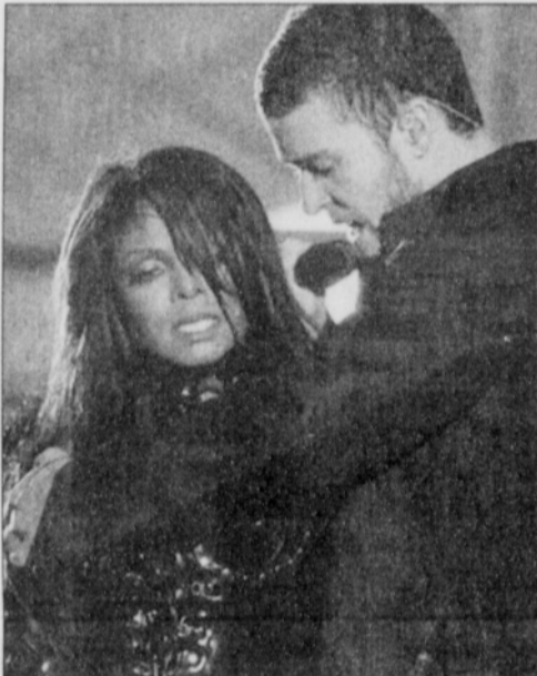
Justin Timberlake reaches across Janet Jackson during their performance just before he pulled off the covering to her right breast, which was partially obscured by a sun-shaped, metal decoration during the half time performance at the Super Bowl in Houston.

The game is scheduled to air live on TNT beginning at 5 p.m. PST.