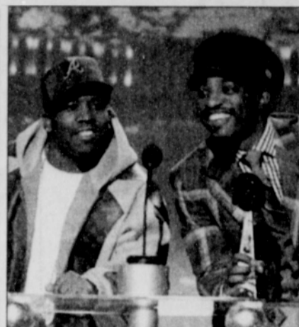
Antoine "Big Boi" Patton (left) and Andre 3000 of OutKast will perform at the beginning of the Sunday, Feb. 15 NBA All Star Game.

"We will change our policies, our people and our processes before the next Super Bowl to ensure that this entertainment is far more effectively dealt with, and is far more appropriate in quality for the Super Bowl game," he said.