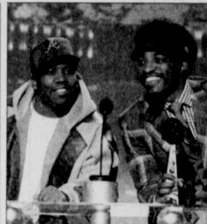
Antoine "Big Boi" Patton (left) and Andre 3000 of OutKast will perform at the beginning of the Sunday, Feb. 15 NBA All Star Game.

"We will change our policies, our people and our processes before the next Super Bowl to ensure that this entertainment is far more effectively dealt with, and is far more appropriate in quality for the Super Bowl game," he said.