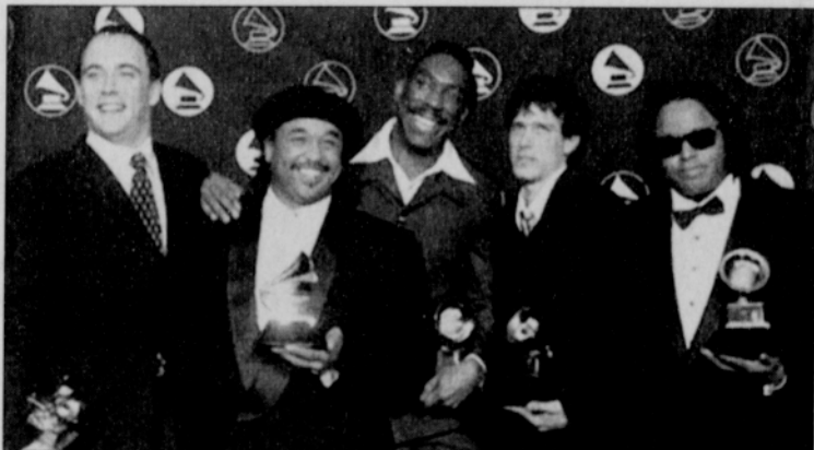
The NAACP will honor the Dave Matthews Band during its Image Awards in March.

The racially mixed music group includes drummer Carter Beauford, bassist Stefan Lessard, vocalist-guitarist Dave Matthews, saxo-