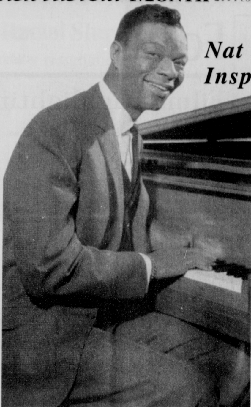
Nat King Cole was one of America's greatest musicians of all-time.

"Trickster Tells This Tale" is showing at the Back Door Theater, 4319 S.E. Hawthorne at 8 p.m. Thursdays through Saturdays and 4 p.m. Sundays through Feb. 21. A "feed the actors" benefit show is Friday, Feb. 6. Tickets are $10 and Sunday matinees are two for the price of one. For reservations, call 503-232-5375.