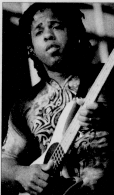
Dance beat surgeon Victor Wooten performs with his magical electric bass.

Wooten will perform a smoldering show in Portland at the Aladdin Theater on Feb. 7.