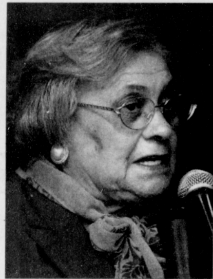
Essie Mae Washington-Williams comes forward to disclose she is the 78-year-old daughter of the late Sen. Strom Thurmond and a black maid who worked in his South Carolina family home.