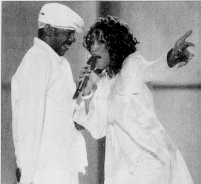
Whitney Houston and her husband, Bobby Brown, perform during the "VH1 Divas" duets show last May.