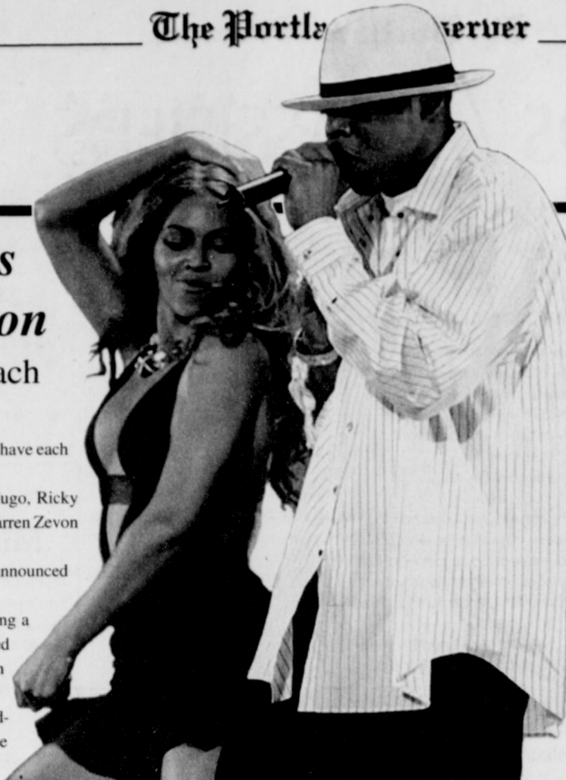
Beyonce Knowles and rapper Jay-Z, performing at the BET awards last summer, earned a leading six Grammy nominations last week.

Williams received two nominations in the category for best rap/sung collaboration: He performed with Snoop Dogg and Uncle Charlie Wilson