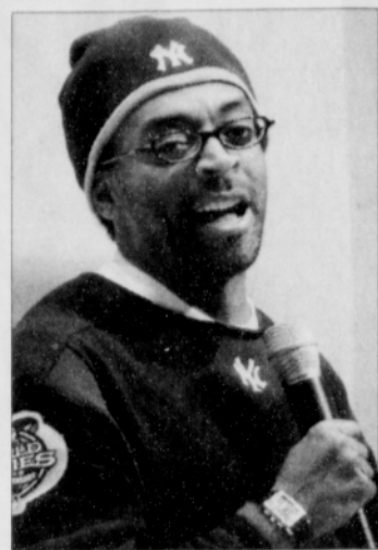
Filmmaker Spike Lee speaks to students at Brown University in Providence, R.I.

"Inside a Thug's Heart" will be released by Kensington Press.