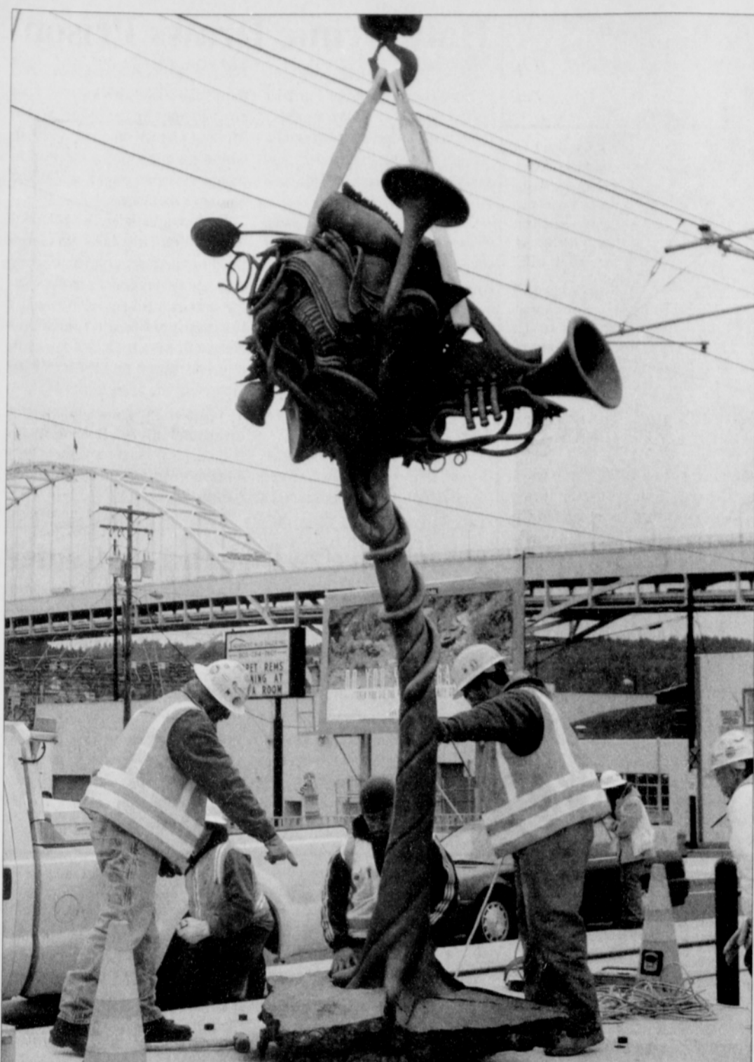
A 12 foot bronze vine representing jazz, art and industry is installed along Interstate Avenue in the historic Albina neighborhood. Thursday's installation marked one of the last major art pieces to go in along the 5.8-mile Interstate MAX line.

Advertise with diversity in The Portland Observer Call 503-288-0033 email ads@portlandobserver.com