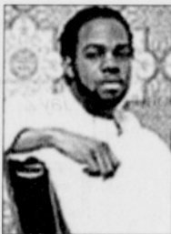
Dwele's album "Subject to Growth" climbs up music charts.

His latest album "Subject to Growth" has spiked in register sales and also seen gains on the Billboard charts where it has achieved pacesetter honors on the Billboard 200 for jumping 69 percent.