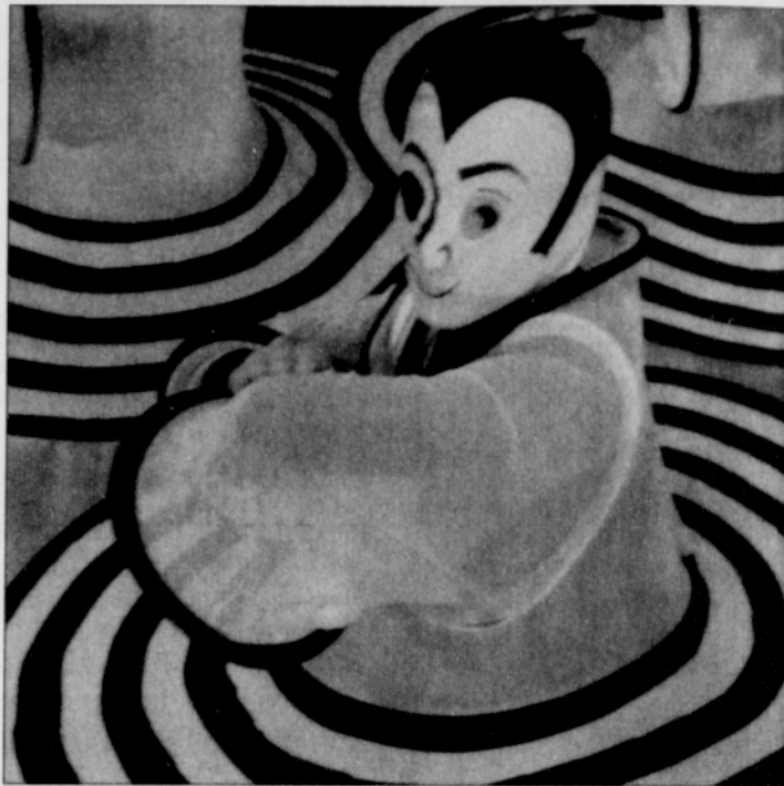
Illusions dance onstage in 'Biglittlethings,' opening this week at southeast Portland's Imago Theatre.

The Imago Theatre is at 17 S.E. 8th Ave. For more information, call 503-231-9851 or visit www.imagotheatre.com .