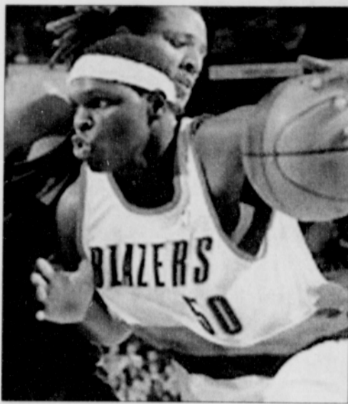
Zach Randolph, a starter and leading scorer on the Portland Trail Blazer team this season.

Police said he was charged after the officer smelled marijuana smoke in his Cadillac SUV. He was also cited for driving without an Oregon license and driving uninsured. Driving under the influence of intoxicants is a misdemeanor punishable by up to one