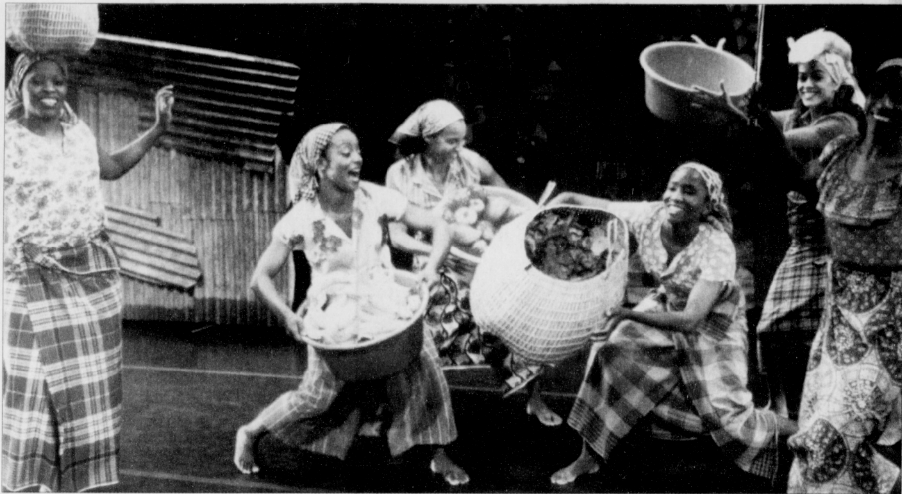
Urban Bush Women perform "Shadow's Child," coming to Portland State University's Lincoln Performance Hall.

Wild Oats Wellness Center presents free workshops at 3535 N.E. 15th Ave. (at Fremont) in upstairs studio A. A lecture on "Loving What is" is from 7:30 to 9:30 p.m. on Dec. 3. A class on Healing Depression and Anxiety is from 7:30 p.m. to 9:30 p.m. Dec. 10 and a class on the benefits of cloth diapering is from 3 to 5 p.m. Dec. 13. Pre-register at 503-281-3262.