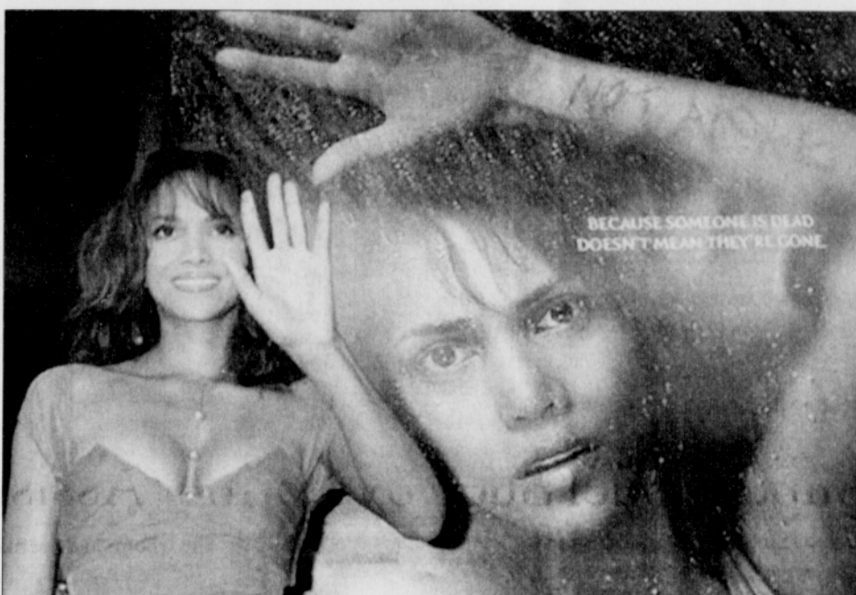
Halle Berry in front of a billboard promoting her new movie 'Gothika.'

Berry broke her arm in May while filming