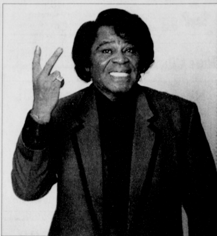
Augusta will erect a statue in honor of James Brown.

Missy Elliott was late picking up her trophy for female rap-hop artist. "Somebody stole my limo, but I'm here now," she said, taking the stage to collect her prize later in the show. Backstage she told reporters: "Somebody is riding around drinking my drinks and partying on their way to the clubs. There's going to be a reward for y'all."