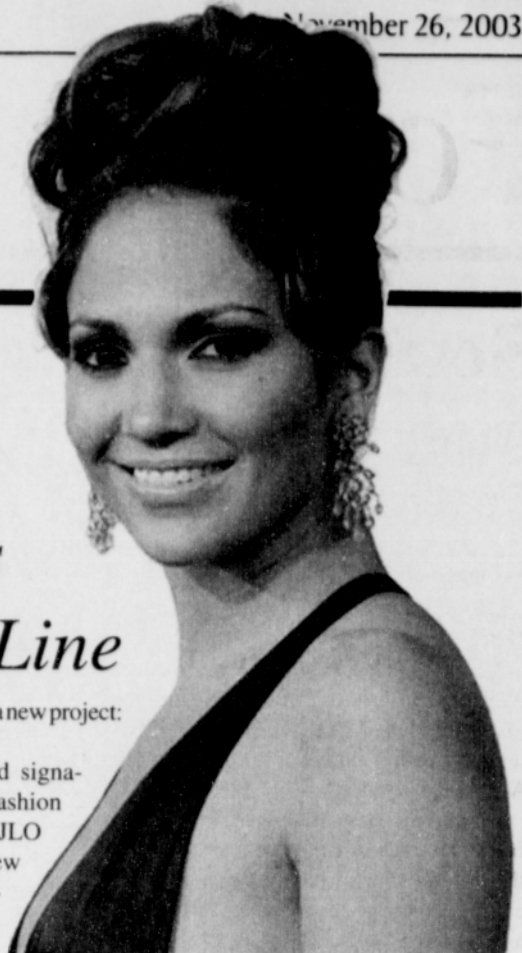
Jennifer Lopez has a new project: the JLO Lingerie collection, which will include bras, underwear and shapewear.