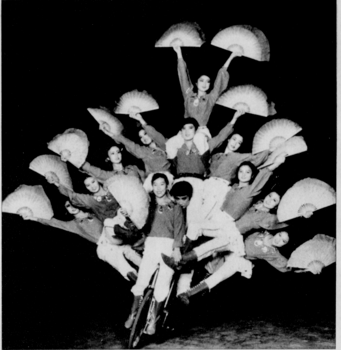
The Peking Acrobats balance on a bicycle not built for 12.

The 73-year-old singer donated the money in the name of the Robinson Foundation for Hearing Disorders, a laboratory he founded in 1987 for the treatment and research of hearing problems.