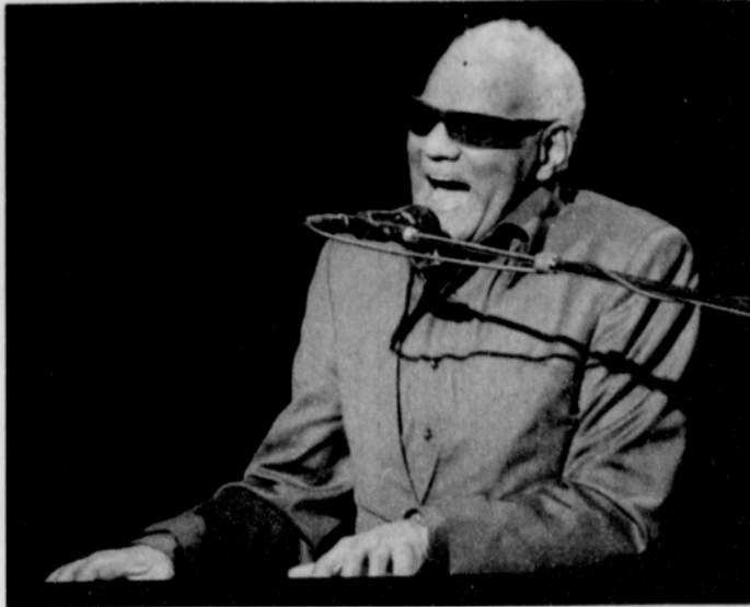
Ray Charles lends his support to black culture studies.

Charles received an honorary degree in May from Dillard, a private, predominantly black school