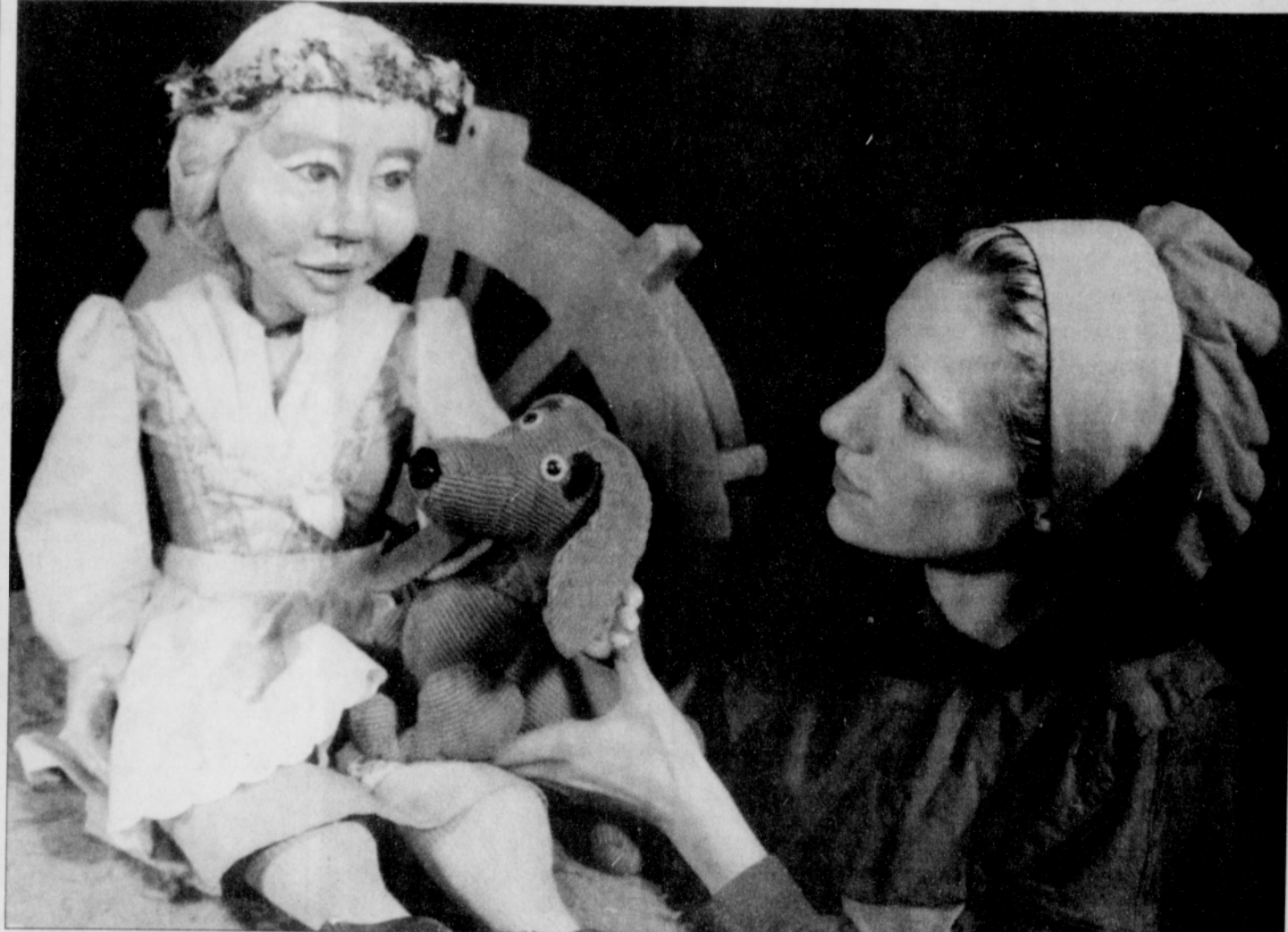
Beautifully sculpted puppets and veteran puppeteers star in Tears of Joy Theatre's Rumpelstiltskin

The play runs from Dec. 12 to Dec. 28 at the Portland Center for