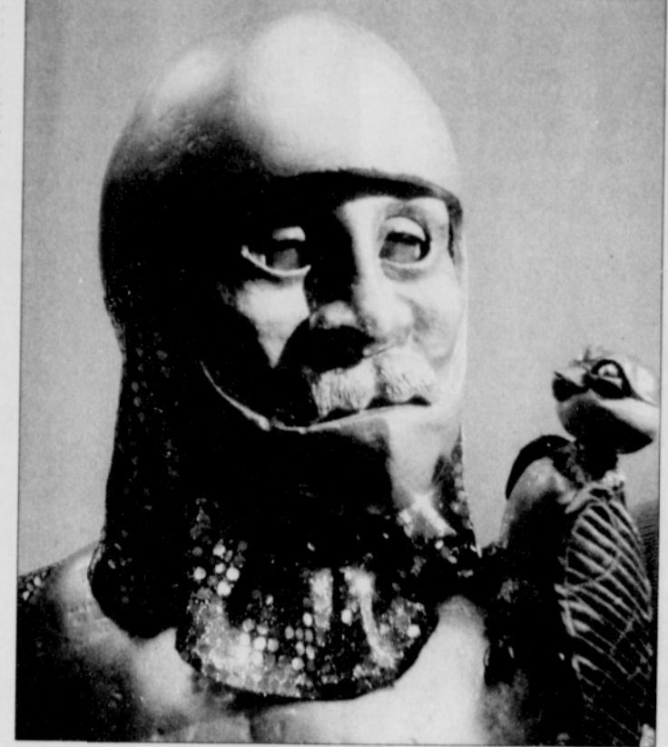
A swallow discovers that a great golden statue is crying because he is unable to help the needy people of his town.