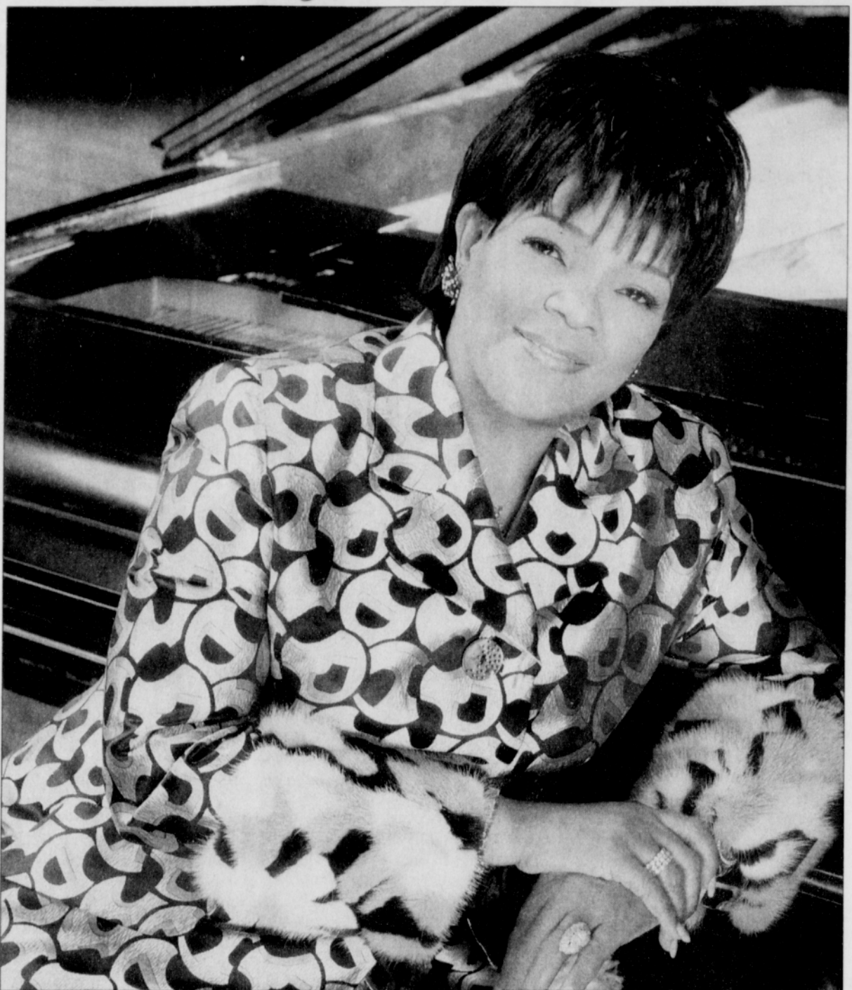
Gospel singer Shirley Caesar hooks up with some of the most recognizable voices in popular music for her newest CD "Shirley Caesar and Friends."

Stockings for gospel music fans will be stuffed this year with one of the most anticipated albums of 2003, "Shirley Caesar and Friends."