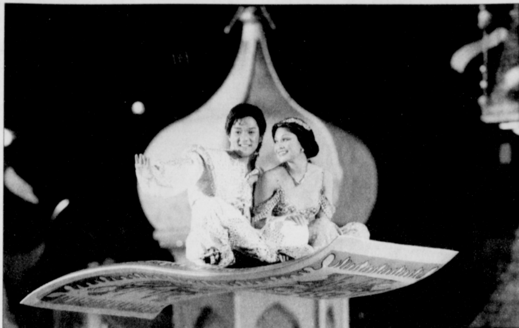
A magic carpet takes Prince Ali and Jasmine to a new world in the Disney on Ice production of Princess Classics, coming to Memorial Coliseum, Nov. 19 through Nov. 23.

The show features a three-story castle, the largest set ever for