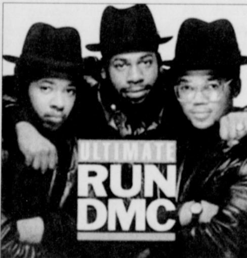
Ultimate Run DMC is a collection of hits.

CD and DVD package documents hip hop group's career