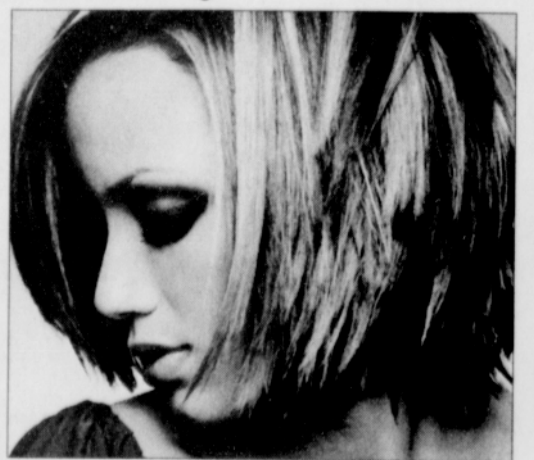
Women of color are embracing lighter haircolor in a new product by Clairol.

Some may like to take it one step further and create an overall warm look in tones of honey and caramel. This stunning technique has even been given the name Soulful Blonde.