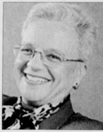
people of that city will have the right to choose what they want for themselves and their children.

The good news is that the plan for school vouchers in D.C. was withdrawn from the U.S. Senate floor in the midst of the Bush administration's $87 billion request for Iraq. But Senate leaders vowed to return, perhaps in the omnibus federal spending bill that will come at the end of the month.